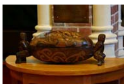
Taranga Te Kumete o Te Ao Maramatanga

Call for Nominations for the offices of President and one committee member...further information is on the college website at http://www.nzcmhn.org.nz/uploads/21290/files/Notice_of_AGM[1].doc