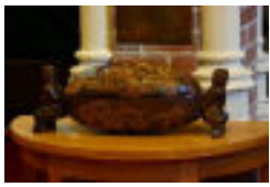
Taranga Te Kumete o Te Ao Maramatanga

Many thanks to all members. Best wishes & Merry Xmas.